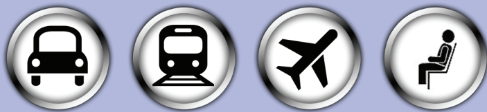
travelling by car travelling by train travelling by plane long sitting