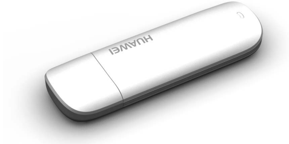
Figure 1-1 E173 profile

Figure 1-1 shows the profile of the E173.